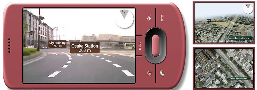
Enkin, a 3D navigation system built for Google's Android, provides a live mode via a video feed (left), a landscape mode (top right), and a map mode.

The first wave of context-aware applications will focus on pulling in data keyed to the user's physical location. "Your phone is going to be a sensor," says Ken Dulaney, a distinguished analyst at Gartner Group. Equipped with magnetic compasses, accelerometers, and GPS, smartphones will begin to support augmented reality applications that draw on detailed information about the location and orientation of your phone.